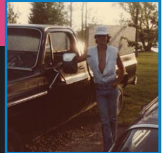
Troy in 1982

Another grey winter is almost behind us. Time to move on to Fun in the Sun...Summer in Michigan! Hard to believe this is the beginning of my 28th year in the lawn maintenance industry. WOW!